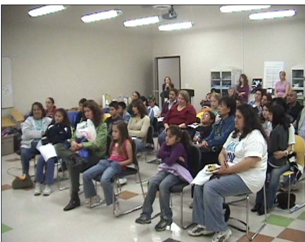
Brothers and sisters who have experienced a family member with autism gather to share ideas